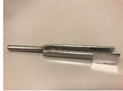
Figure 2 Mirror hot glued down to tuning fork.