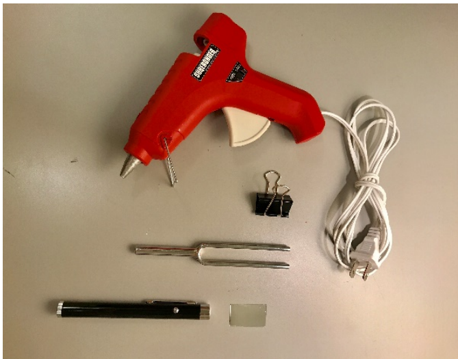
Figure 1 Gathered materials for this demo.