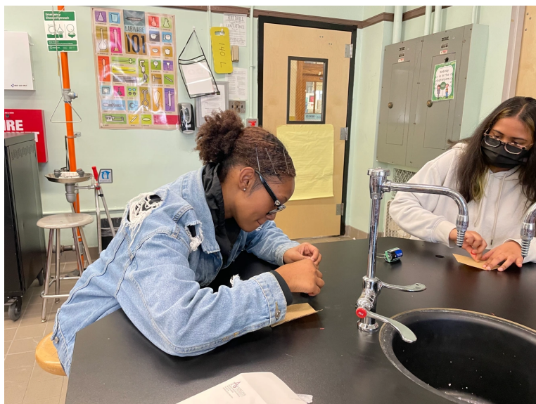
Almost there !:)