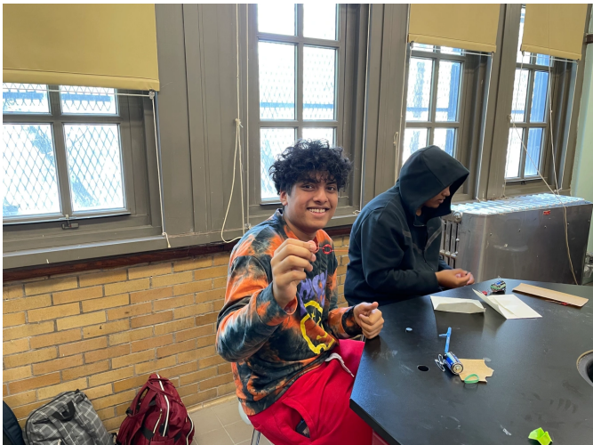
Student making DC Motors