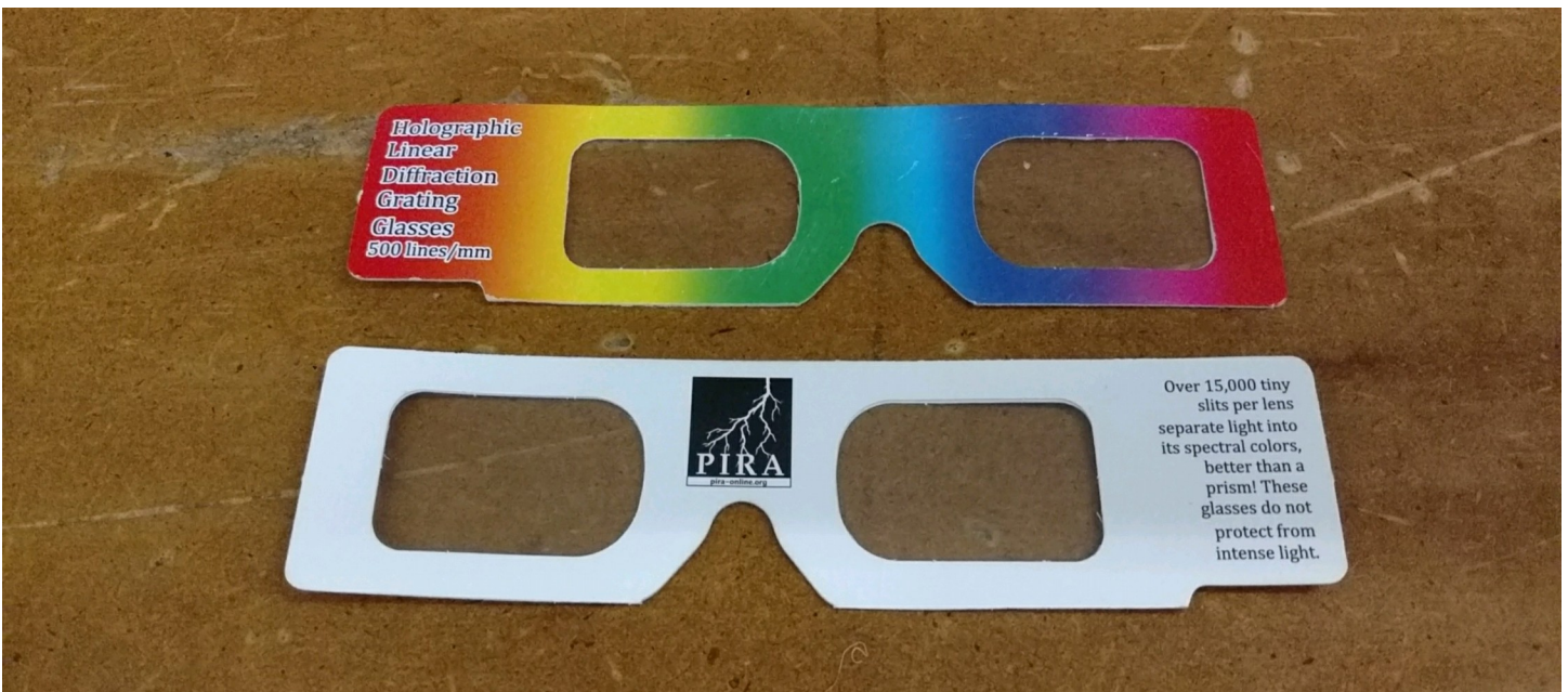
Take-home diffraction glasses