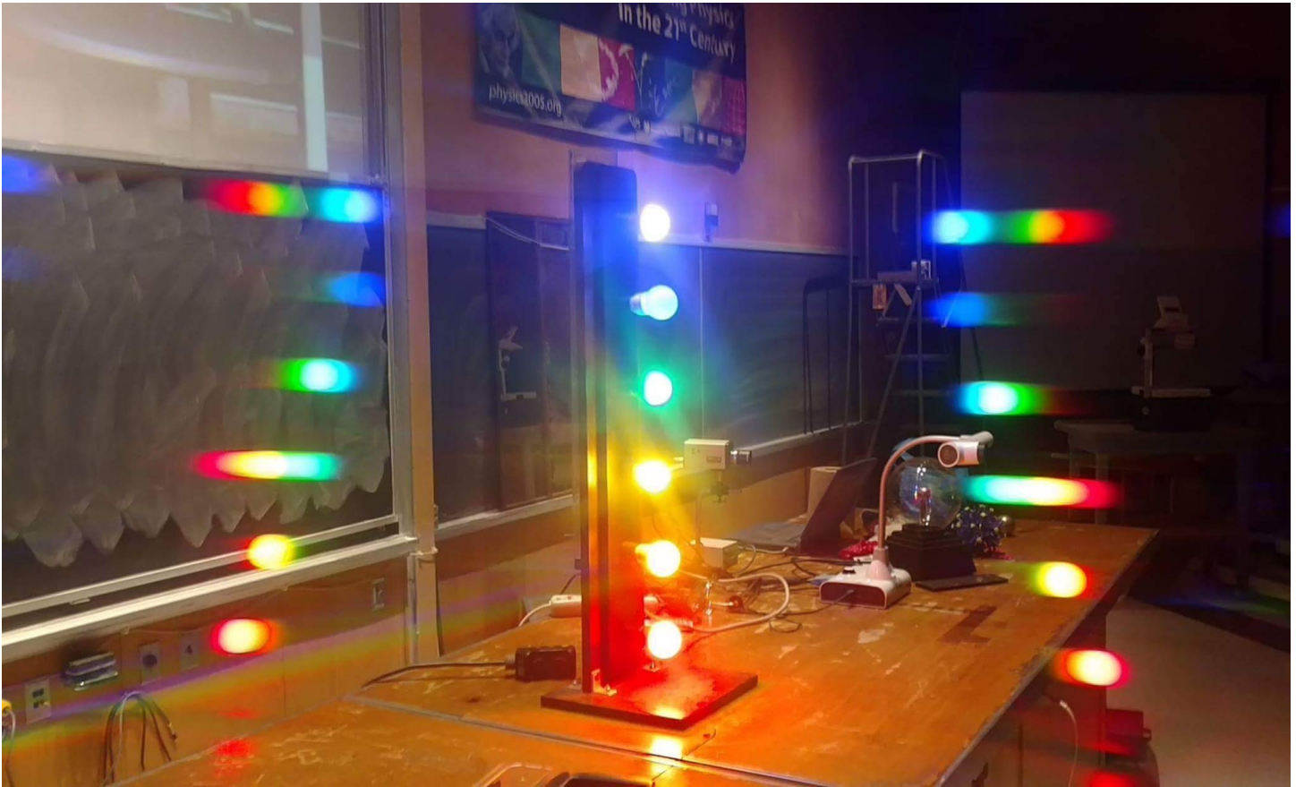
View of optical demo through diffraction glasses