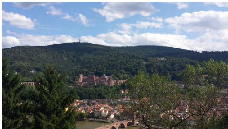
A photo of Heidelberg.

This year marked the 29 th ICPS and was held at Germany's oldest university—Heidelberg. The International Association of Physics Students (IAPS) holds the ICPS annually in various international locations. IAPS members form a committee to help the host country make ICPS possible. As in the past, this year's ICPS was held for one week and was full of physics talks, opportunities to network internationally, and cultural experiences. The motto of the this year's conference was “Meet people, do physics, exchange knowledge.”