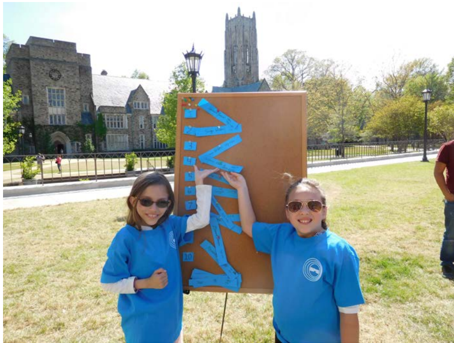
A couple of contestants proudly show off their scores.