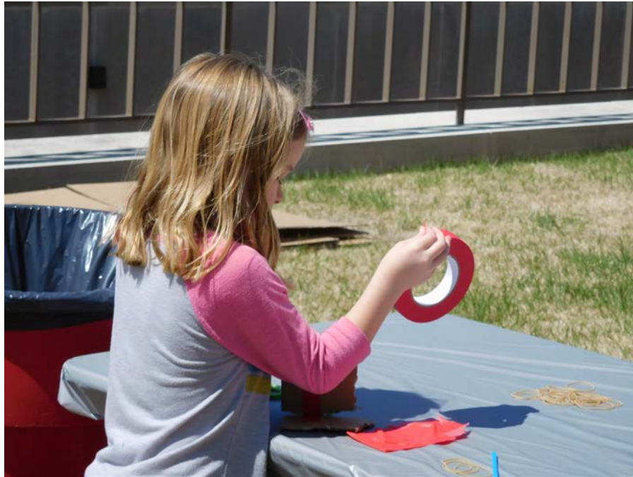
Participants used colored tape and straws to personalize their projects.