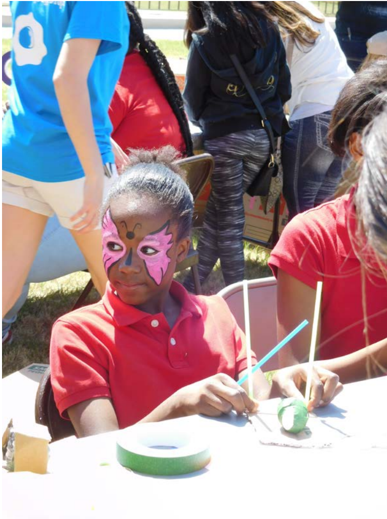
A participant from Girls, Inc., looks around.