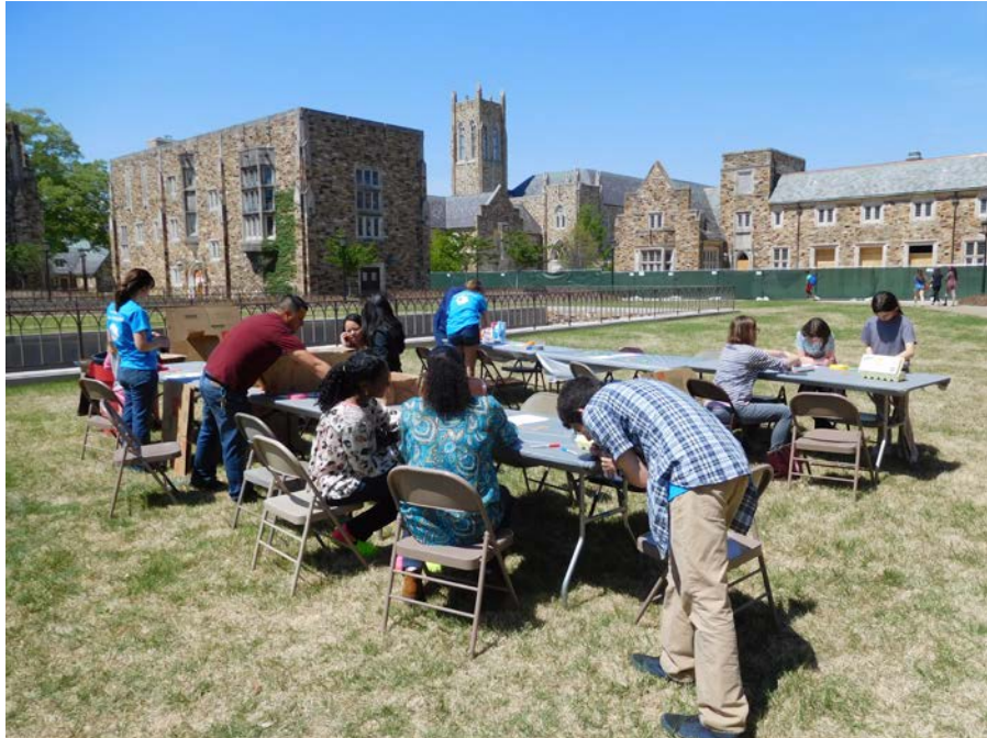
SPS members work with Memphis girls to construct egg cases.