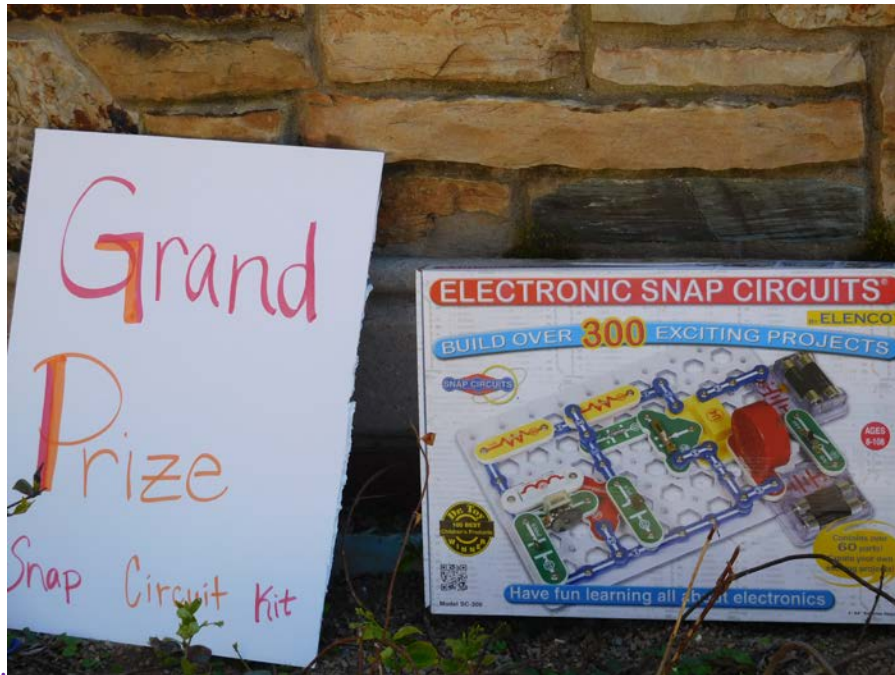
The grand prize is set on display.