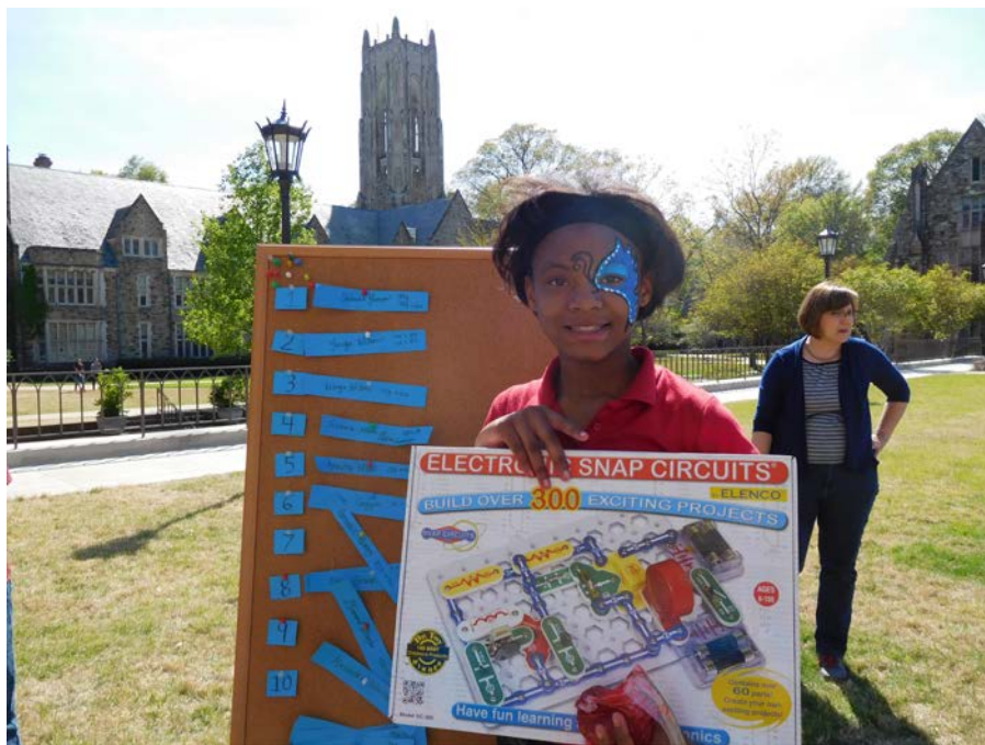
The winner poses with her prize.