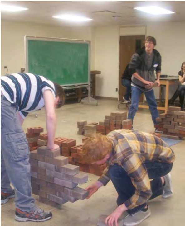
Now that's a stairway!