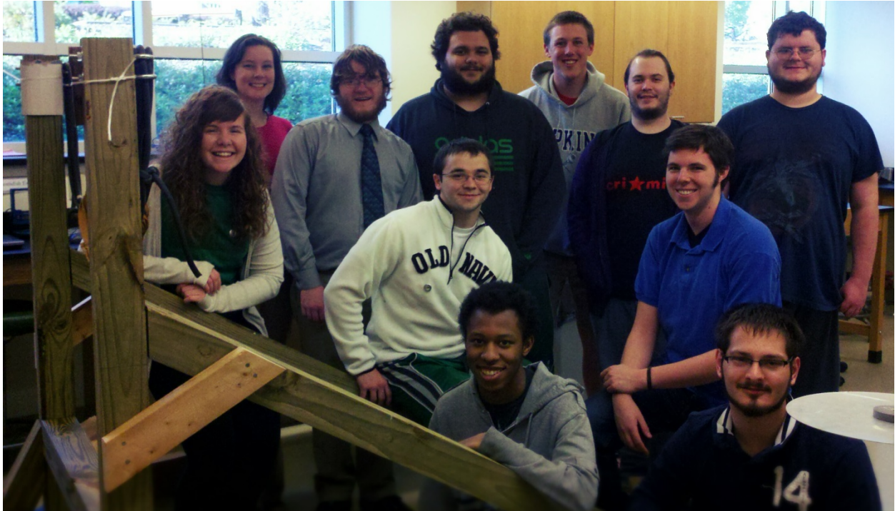
Photo of the Lebanon Valley College Society of Physics Students with the “The Flying Dutchman,” the slingshot that took 3 rd place at the Cantalobber Contest at Kutztown University.