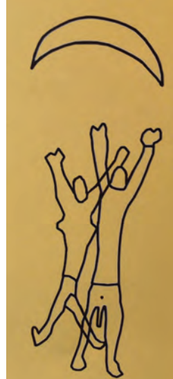
ABOVE This sketch of a rock carving may depict two people reaching for a boomerang or for the moon.

For more details on the work of Cilla and Ray Norris and their collaborators, visit their site, Australian Aboriginal Astronomy, at www.emudreaming.com .