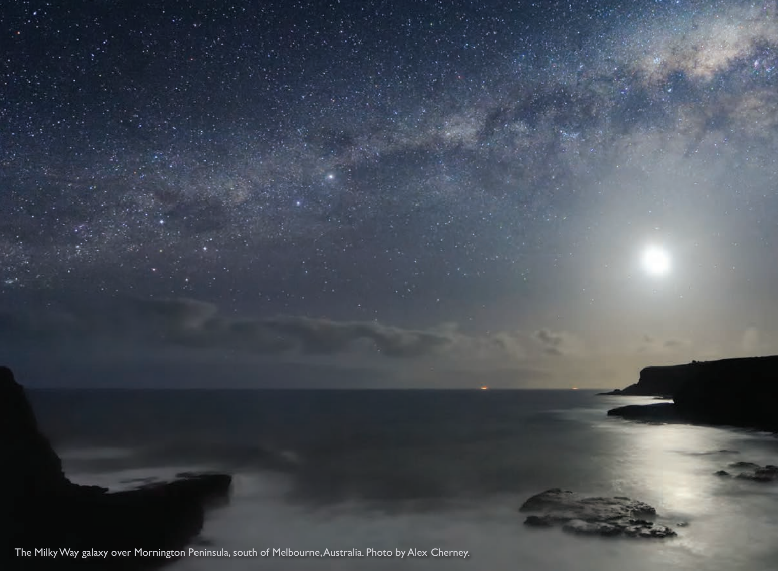
The Milky Way galaxy over Mornington Peninsula, south of Melbourne, Australia.