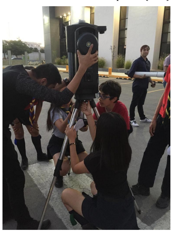
Figure 4 A member of the Astronomy Club giving instructions on how to operate the telescope

We hope to encourage more students that participate in the outreach activities to take part in research projects at earlier stages of their education and also to contribute to the development of a greater interest in physics and astronomy among the children that often join our astronomical observations. With a project like the one described here, the SPS program in our university would become more diverse by encouraging a greater participation, thus motivating more projects, in multiple areas of physics, to be proposed in the near future. By having the opportunity to work on our radio telescope project we'll acquire valuable research experience important to our professional careers, by giving us a preview of even larger projects in the near future.