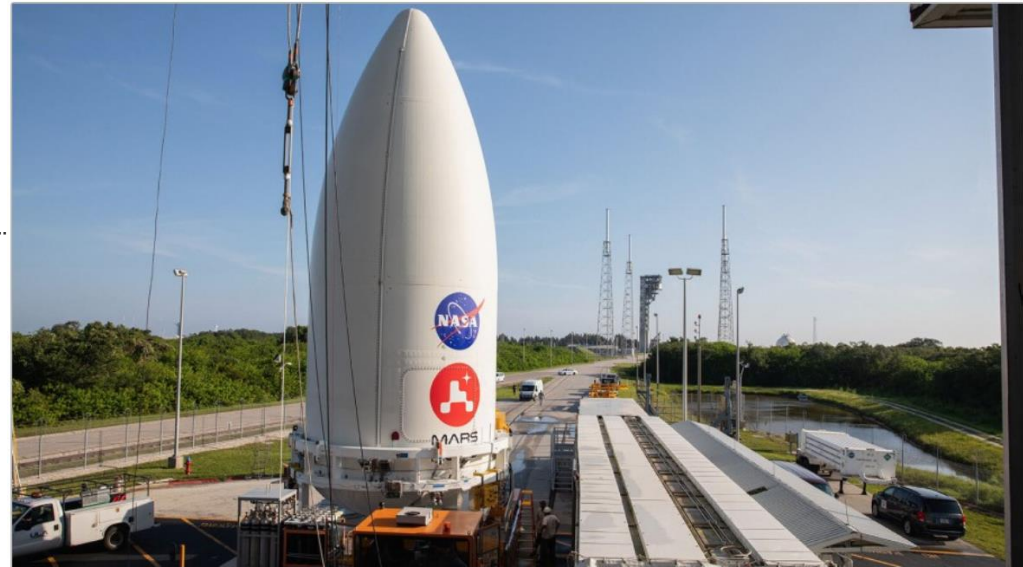
The rocket nosecone containing the Mars Perseverance rover at Cape Canaveral Air Force Station on July 7.